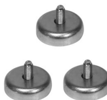
MAGNET KIT 803087