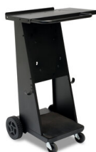
TROLLEY - DIAGNOSTIC 803077